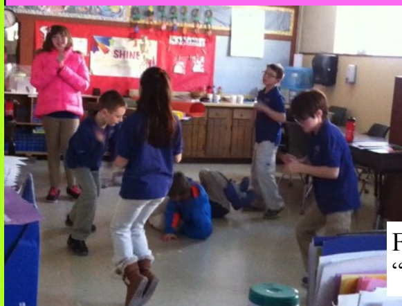
Fourth Graders dancing during a "too cold outside" recess.