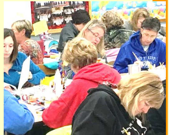
Sacred Heart teachers working with other teachers in the diocese at the October 14 th Marzano workshop in Pierz

and PLC (Professional Learning Community) time, working together to develop these strategies in their classrooms that benefit our students. Our students' test scores are starting to reflect these efforts.