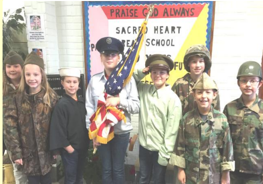
Fifth graders dressing the part