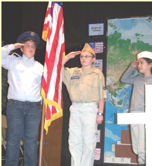
The 5 th Grade Color Guard

The month of November is a month of Thanksgiving. Sacred Heart Area School students did a marvelous job of showing they are thankful last Monday in our veterans program. This annual program is a great lesson in gratitude for us all. One of the keys to living a happy, fulfilled life is in being grateful for all we have. We are grateful and happy to live in this wonderful nation, which has been preserved by people like our veterans.