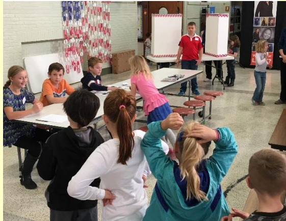
Students in line at the SHAS poles on Tuesday