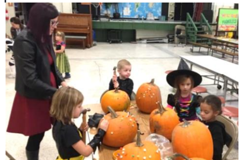
Preschoolers & kindergarteners enjoying Halloween

On Tuesday students enjoyed some Halloween fun in their classrooms, dressing up in their costumes, having treats, and playing games. Parents came in the morning to share fun times with preschoolers and kindergarteners, while the 1 st - 5 th graders had their costume parade in the afternoon.