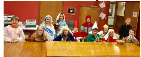
4 th and 5 th graders in All Saints Day costumes

Students and staff went to All Saints Day Mass on Wednesday morning. In the afternoon, some students dressed up as their favorite saint. This new practice stimulated new discussions about the saints of the Church, what special things they did in their lives, and how they are important role models to us all.