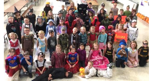
1 st -5 th graders Halloween afternoon

On Tuesday students enjoyed some Halloween fun in their classrooms, dressing up in their costumes, having treats, and playing games. Parents came in the morning to share fun times with preschoolers and kindergarteners, while the 1 st - 5 th graders had their costume parade in the afternoon.