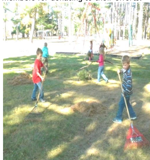
SHAS 1 st Graders at the Workathon in Pine Grove Park

The 1st Annual Sacred Heart Area School Workathon took place on Wednesday, October 15, 2014 starting at 12:00pm and ending around 2:30pm. Parents, staff, and students in 1st, 3rd, and 5th grades worked at Pine Grove Park, 2nd grade worked at Veterans Park, 4th grade at Northern Pacific Park, and preschool and kindergarten on the school grounds, picking up sticks and raking leaves and pine needles. The event was enjoyed by all. Thank you families for your service to the community and for raising $7,600 for SHAS! Thank you members of our school and parish families and community members for donating to their efforts!