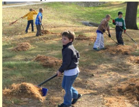
Grades 2 and 4 working at Northern Pacific Park

The 2 nd Annual Sacred Heart Area School Workathon took place on Wednesday, October 14, 2015, starting at 12:00pm and ending around 2:30pm. Parents, staff, and students in 1st, 3rd, and 5th grades worked at Pine Grove Park, 4 th grade worked at Veterans Park, 2 nd grade at Northern Pacific Park, and preschool and kindergarten on the school grounds, picking up sticks and raking leaves and pine needles. It was enjoyed by all who participated. Thank you families for your service, and raising $7,000 for SHAS! We did not quite make our goal of $9,000 but it was still a great success. In order for us to raise $9,000 it would have taken 100% participation which we unfortunately did not get. Students who did meet their goal or were the top three fundraisers in the school received their prizes yesterday. The top fundraisers in each class will go to Dairy Queen for lunch by fire truck Wednesday, October 28 th .