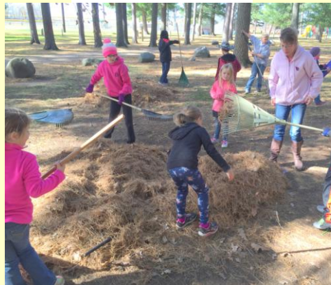
Grades 1, 3, and 5 working at Pinegrove Park

The 2 nd Annual Sacred Heart Area School Workathon took place on Wednesday, October 14, 2015, starting at 12:00pm and ending around 2:30pm. Parents, staff, and students in 1st, 3rd, and 5th grades worked at Pine Grove Park, 4 th grade worked at Veterans Park, 2 nd grade at Northern Pacific Park, and preschool and kindergarten on the school grounds, picking up sticks and raking leaves and pine needles. It was enjoyed by all who participated. Thank you families for your service, and raising $7,000 for SHAS! We did not quite make our goal of $9,000 but it was still a great success. In order for us to raise $9,000 it would have taken 100% participation which we unfortunately did not get. Students who did meet their goal or were the top three fundraisers in the school received their prizes yesterday. The top fundraisers in each class will go to Dairy Queen for lunch by fire truck Wednesday, October 28 th .