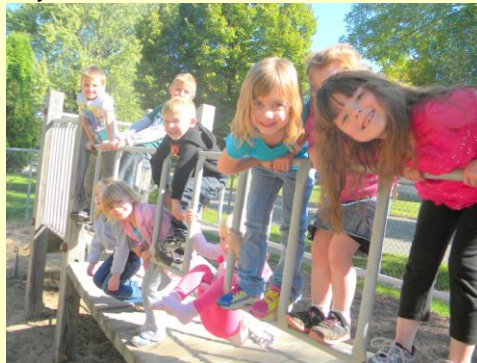
Kindergarteners and preschoolers enjoying a beautiful day at play

We have certainly been blessed with beautiful fall weather. The children have been enjoying outdoor recess most days. Please help us continue to maintain a smooth season by staying aware of weather conditions in the forecast and having your children dress appropriately. We all know what Mother Nature will be sending our way soon.