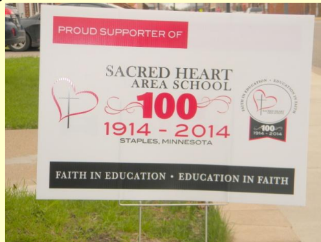
Centennial yard markers are available at school office.

Don't forget, September 14 th is our Centennial Anniversary! Plan to be around for a weekend of fun festivities to celebrate 100 years of SHAS. Take advantage of our new centennial yard markers now available in the school office. This $20 package includes a centennial window cling, which is valued at $5 if purchased separately. Show your school centennial pride, by placing your yard marker in your front yard this summer.