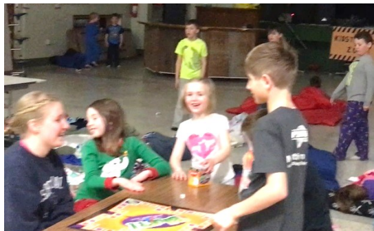
Board games, ball games, and movies were played

23 slumber party students awake past 3:30AM On Friday, April 20 th , SHAS hosted its annual family appreciation dinner, with complimentary pizza made by Giovanni's Pizza. After dinner, we enjoyed our last school dance of the year, and then finally the overnight slumber party. During the slumber party, students had the option of playing board games, ball games, and movies throughout the night, with the final band of "late-nighters" falling asleep around 4:00AM. 43 students decided to spend the night. 23 of them stayed up past 3:30AM. This is one of the most highly anticipated fun events of the school year for students.