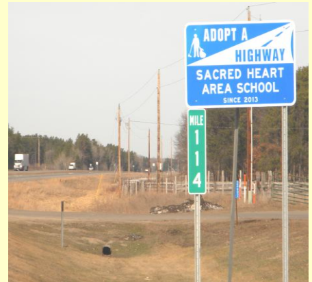
SHAS's newly adopted US Highway 10 west of Motley