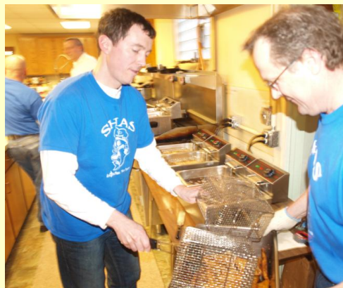
Dedicated fish fry workers

All of us from Sacred Heart Area School wish to thank those who supported our Lenten fish fry dinners by coming to dine with us each week. Our families had a great time frying, serving, and cleaning at these events which raised thousands of dollars net for our school and were much enjoyed by customers. We especially want to thank Sacred Heart Circle 15, the Staples Lions, the Knights of Columbus, and most of all, our fish fry committee that invested several hours each Friday to ensure success. Thank you for your incredible works!