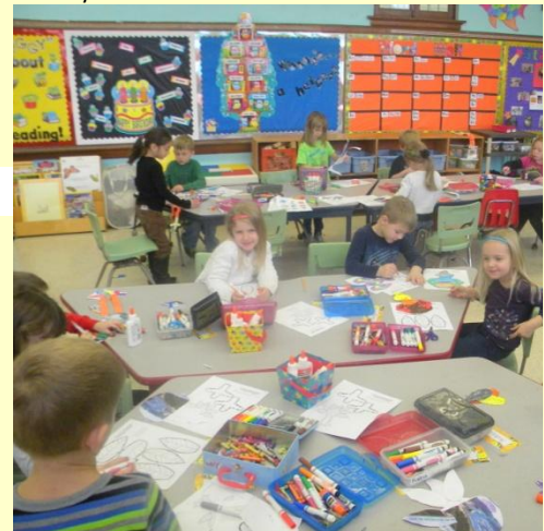
Always busy in Kindergarten

We are looking forward to the upcoming school year, which will be Sacred Heart Area School's centennial year. We invite all families of Christian faith, especially our local parishioners, to consider joining our school family. Our Preschool and Kindergarten Round-up will be held on Tuesday, April 8 th , in the school gymnasium. This open house from 6:30-7:30pm is a great opportunity for families to meet their teachers and see their school for next year. Please help us reach out to new families from our neighborhoods by spreading the word about our school. We invite parents with children from ages 3 to 5 years to attend this event.