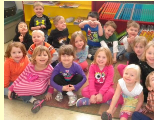
SHAS Preschool Students

We are looking forward to the upcoming school year, which will be Sacred Heart Area School's centennial year. We invite all families of Christian faith, especially our local parishioners, to consider joining our school family. Our Preschool and Kindergarten Round-up will be held on Tuesday, April 8 th , in the school gymnasium. This open house from 6:30-7:30pm is a great opportunity for families to meet their teachers and see their school for next year. Please help us reach out to new families from our neighborhoods by spreading the word about our school. We invite parents with children from ages 3 to 5 years to attend this event.