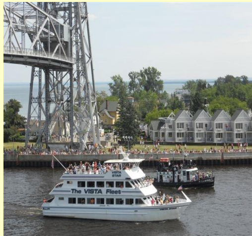
Duluth's Vista Fleet Vessel passing under the Aerial Lift Bridge

If you have not yet turned in enrollment forms for the 2016-2017 school year, please do so as soon as possible or contact the school regarding your intentions for next year. This will benefit all our parents, staff, and students. Thank You!