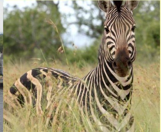
Safari North Zoo, Brainerd