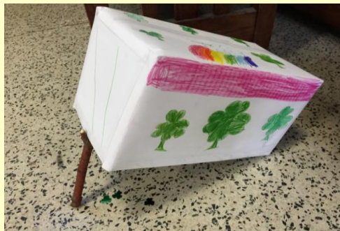
A set and baited leprechaun trap

On Tuesday, St. Patrick's Day, the Kindergarteners were very excited to try their homemade leprechaun traps. Traps were set up throughout the school, with hopes that one would be caught. Several tell-tale signs were left behind, including sprung traps and messed up play areas, but in the end, they had no luck with a confirmed catch. Perhaps next year!