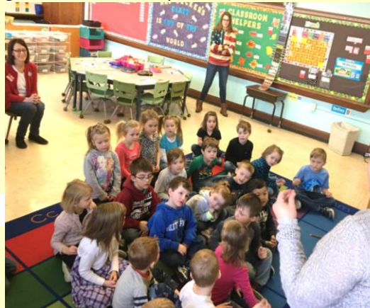
Next year's kindergarteners with the current kindergarteners