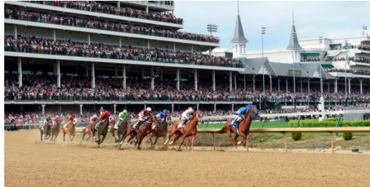
This year's Spring Blast theme is The Kentucky Derby

New families might be asking themselves "What is the Spring Blast?" On Saturday, May 5 th , the school will be transformed for an adult night out that includes dinner, drinks, games, and live and silent auctions. This year's theme is The Kentucky Derby , so we will sip some mint juleps and raise money for our favorite cause, the school. It is a great way to meet other families in the school community. Spring Blast is most definitely a favorite social event of the year, drawing many to come back year after year. It is definitely a "blast". $30 tickets are available at the school. We hope to see you there!