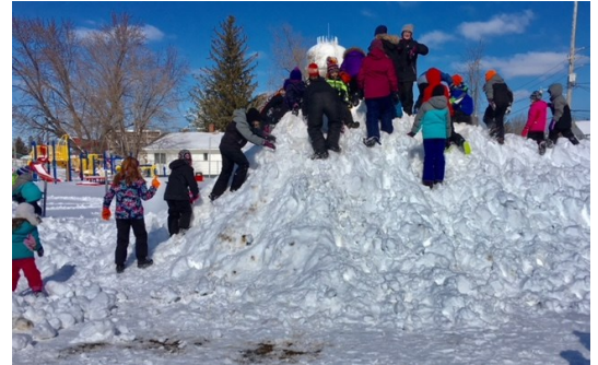
Students enjoying a lot of snow at Tuesday's recess

Monday's snow storm was a "doozy", closing school for the day and delaying it 2 hours on Tuesday. If you did not receive a notification regarding these closures, via text or phone from the district, please let us know so we can get you on the list. Please remember that if school is 2 hours late, everything is 2 hours late, including before school care. If school closes early, due to weather or any other safety related reason, there is no afterschool care, and you will need to make arrangements for your child to be picked up or ride the bus home.