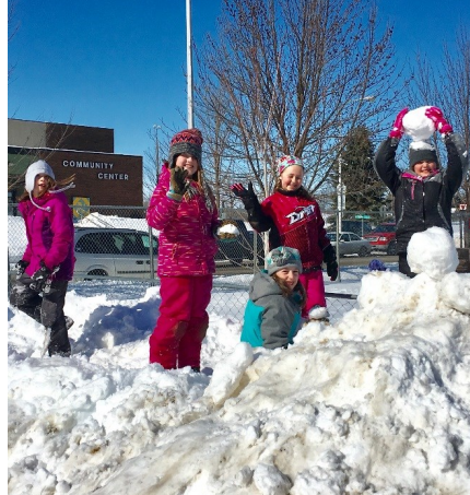
2 nd grade girls enjoying a hill of snow

After a very cold winter, with a lot of inside recess days and minimal snow, the boys and girls felt as if they were in Heaven this week, enjoying tons of snow and warm temperatures during outside recess.