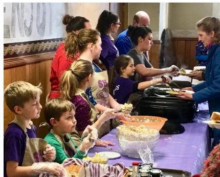
kindergarten & 4 th grade families serving at fish fry

We are so grateful to our school families for all they do. It takes the efforts of all to make this a great school for our children. People pull together for the good of all. This alone is a great lesson in life for the students.