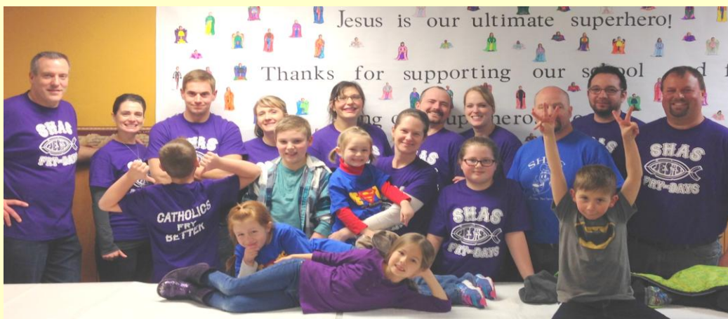
2016 Fish Fry Committee