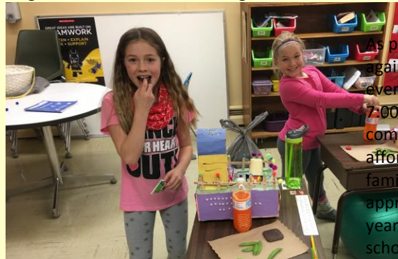
4 th graders enjoying their Valentine's Day treats