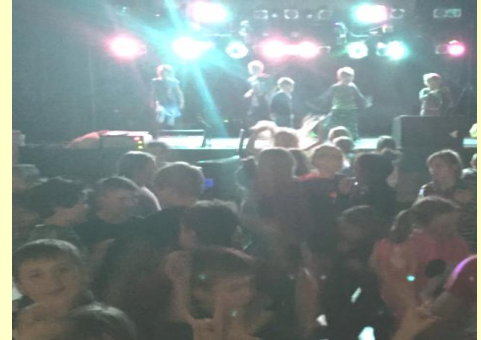
A full house for the Wednesday night CSW dance

Last night's dance was enjoyed by several school children and their families, as was the entire week of fun themed dress up days and fun events. Monday was Super Hero Day with a Minute to Win-it competition for the kids. Tuesday was Camouflage Day where we especially remembered prayer in our daily lives, received an extra afternoon recess and drank hot cocoa. Wednesday was Pajama Day where we especially remembered to take the time to read for enjoyment. Today was Sunglasses Day with our all school Mass, and the staff shared in a potluck lunch together. Tomorrow we will wrap up the week with a fun Mismatch dress up day with popcorn and a movie at the end of the day.