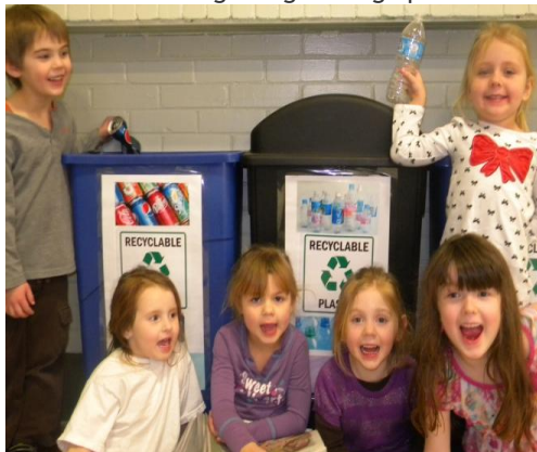
SHAS students ready to recycle