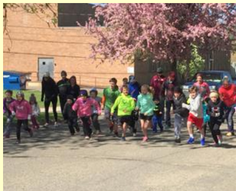
Children at the start of their 1K Run last May