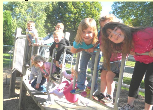
SHAS students playing on their playground

Thank you participants of our “Dollar a Day” Centennial Fund Drive! Cans and boxes will be collected through the month of January, and can be dropped off at the school. Those who have pledged to the “Dollar a Day” drive will be contacted by mail in the next week. All funds raised will go toward enhancing Sacred Heart Area School's “curb appeal” for its new century, with the most popular project being playground improvements. There will be a committee formed in the near future for the planning of improvements to be made. If you are interested in participating, watch for more information coming soon.