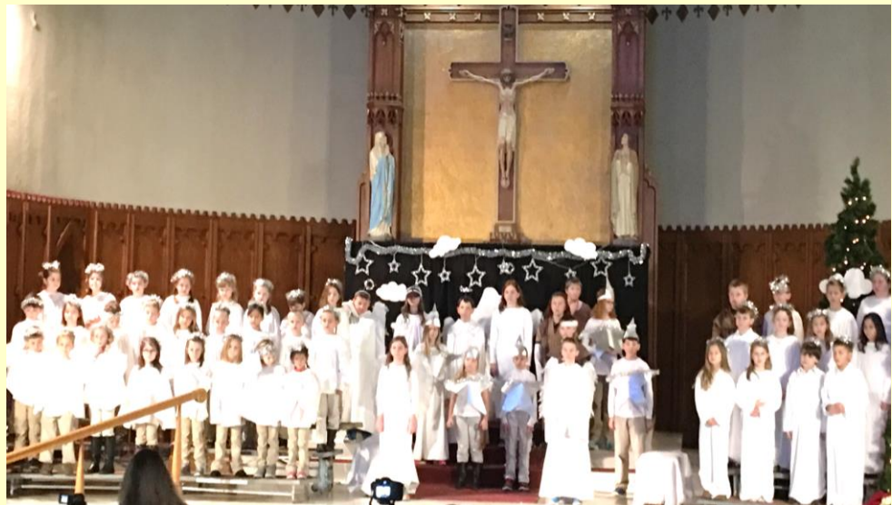
Each year the students of SHAS along with help from the staff, put on phenomenal Christmas program performances, that truly place us in the presence of God and the true meaning of Christmas. Thank you to all who played a part to make this happen again this year.