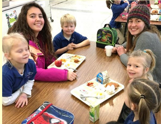
Visitors from Spain and Czech Republic sharing lunch time with kindergarteners