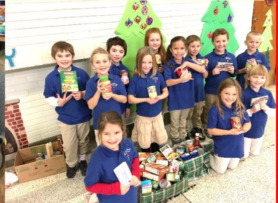
2 nd graders with their foodshelf donations

We hope your Advent Season has been blessed so far. The students of SHAS have been hosting two community service projects which all school families were invited to participate in this month.