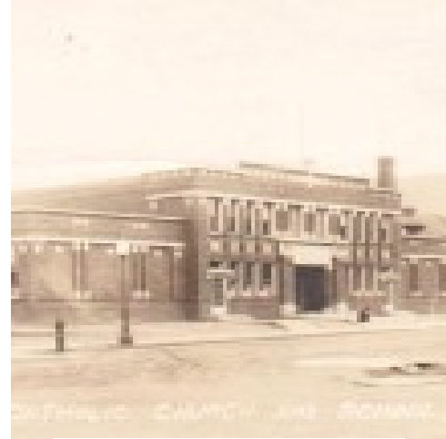
Sacred Heart Area School circa 1920's

has meant to our community, we have an exciting centennial anniversary weekend planned. We hope you can join us!