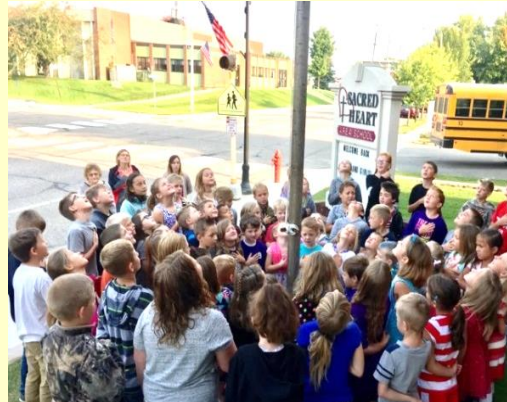
SHAS students pray and pledge around the flagpole

Last Monday, the kindergarten - fifth grade students at SHAS talked about, and watched a short video of, the happenings of September 11, 2001. An important part of our discussion was about forgiveness, and praying for our enemies. This, being one of the hardest things to do as a Christian. Afterwards, we went out to the flagpole to honor and remember those who suffered or lost their lives, with the Pledge of Allegiance, Star-Spangled Banner, and the Lord's Prayer. On September 11, 2001, 2,996 people lost their life, 6,000 others were wounded. 265 were on the four planes used for the attacks, 2,606 in the World Trade Center, and 125 at the Pentagon,