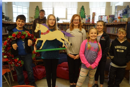
Our horse was the winner! Ag Safety Day!